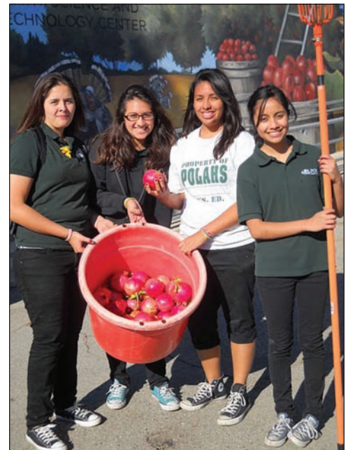
Port of Los Angeles High School students show off some of their crops.

POLAHS students will team up with resident volunteers every other Tuesday throughout the year, putting their sustainable farming methods and urban design into practice.